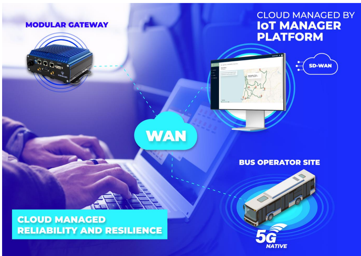
Figure 1 – Cloud Managed | Reliability and Resilience

SD-WAN (Software Defined - Wide Area Network) makes a Connected Bus solution more flexible, automatable, resilient, and reliable. It is cloud managed by IoT Manager/Multi-Tenant Platform (Figure 1) and supports ZTP (Zero-Touch Provisioning) and VPNs.