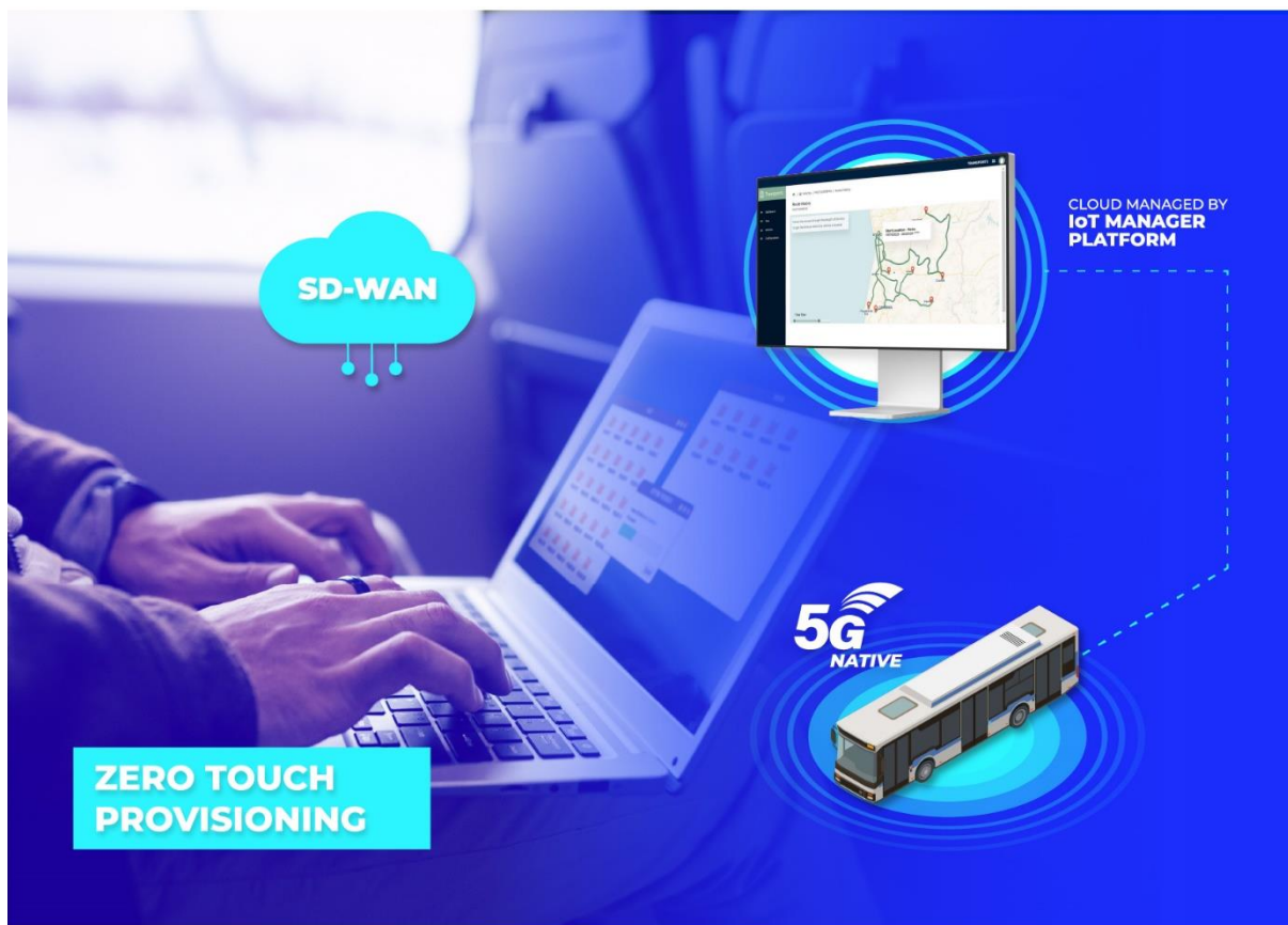
Figure 1 – Connected Bus Zero-Touch Provisioning with IoT Manager Platform

This tool enables Systems Integrators to install networking devices such as modular Gateways without manual intervention, as depicted in Figure 1.