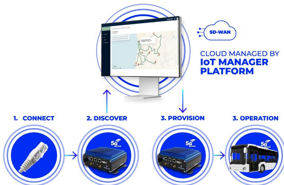
Figure 2 – Diagram | Connected Bus Modular Gateway Zero-Touch Provisioning Stages

When modular Gateways are connected, these configurations are associated, among which the connection to the corresponding IoT Manager/Multi-Tenant Platform is assumed, i.e., the VPN is already configured from scratch in the equipment image (Table 1).